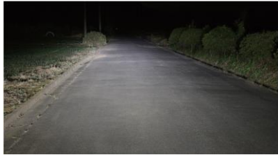
LEH170 H4 6600K Hi Beam