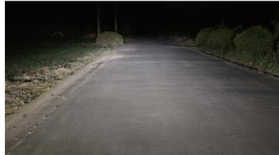
LEH180 H4 6000K Hi Beam