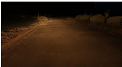
Factory Halogen H4 Hi Beam