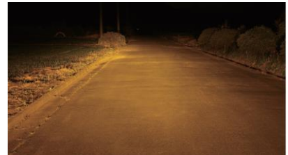
LEH190 H4 2500K Hi Beam